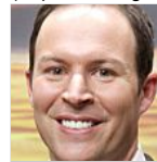
People on the