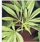
Conflicts over medical marijuana grow sites