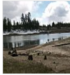
Wanted: info on who drained Crook Co. reservoir