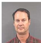
Director of Central Oregon health care group