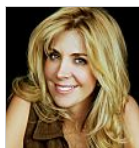
Celebs you didn't know passed away: #17 is